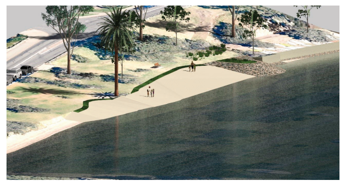
NB: Drawing is an artist impression only and is not to scale.

Specific actions include construction of a limestone headland to slow down sand loss, revegetation works, realignment of the stormwater drainage system, and reinstatement of the beach. As a guide, similar works have been completed recently at the South Perth foreshore to good effect. Reflecting our shared stewardship in this matter, this will be a 50/50 funded